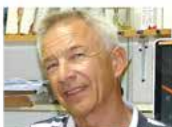
Melvyn Lipitch Scriptwriter A Letter from London