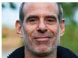
Samuel Maoz Director & Writer Foxtrot