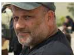
Eran Riklis Director & Writer Shelter